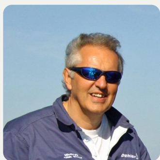
Colin Crawford Prizes